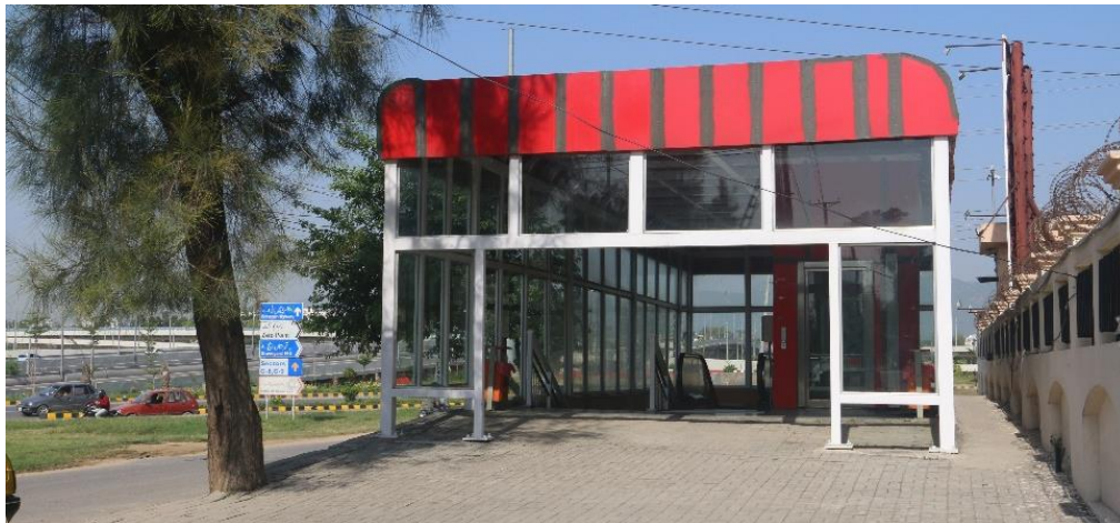
Terminal of Metro Bus Service outside AIOU Main Campus