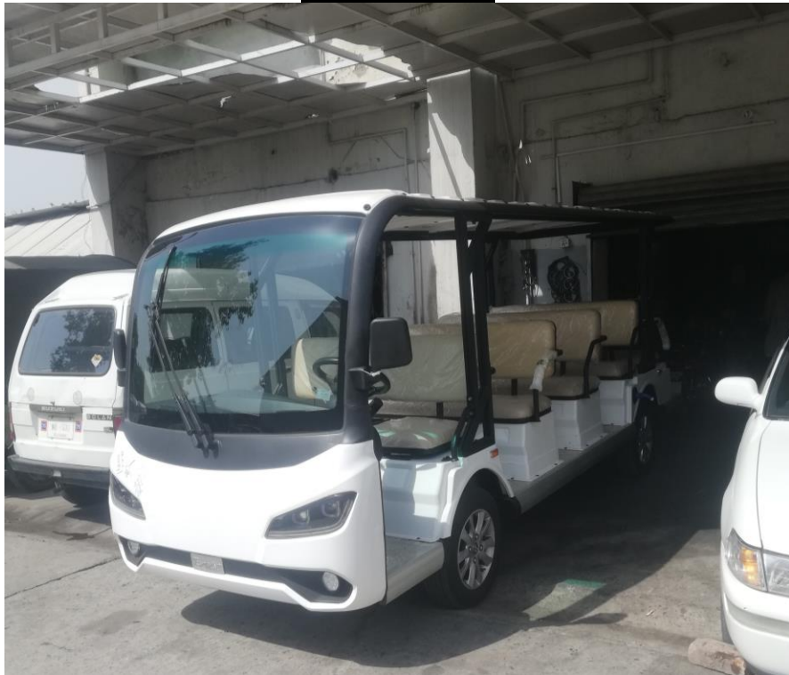
Zero Emission Vehicles at AIUO