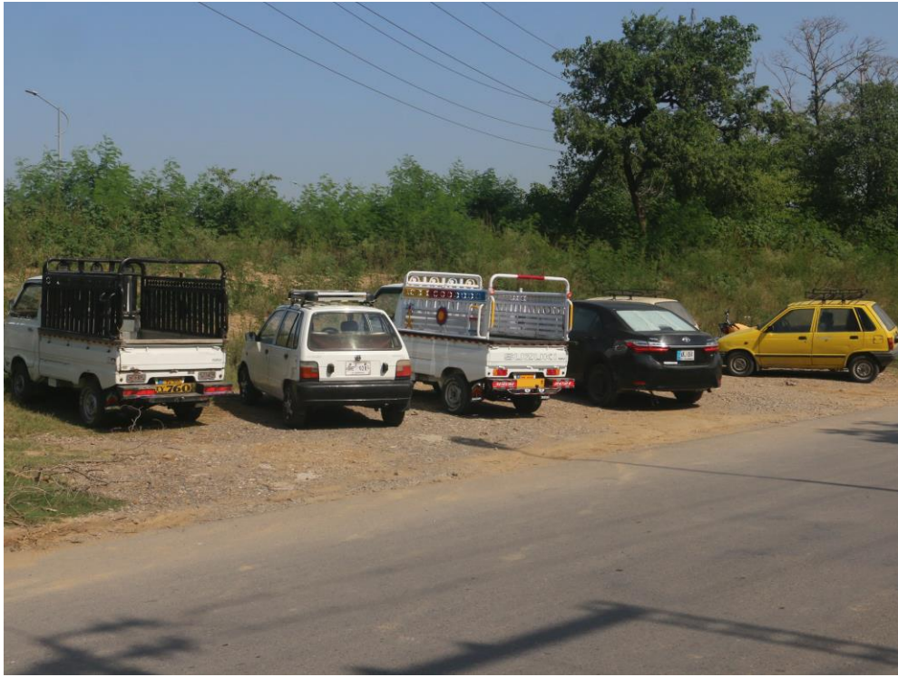
Outside parking of private vehicles