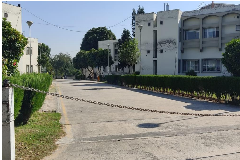
Carbon free Zones