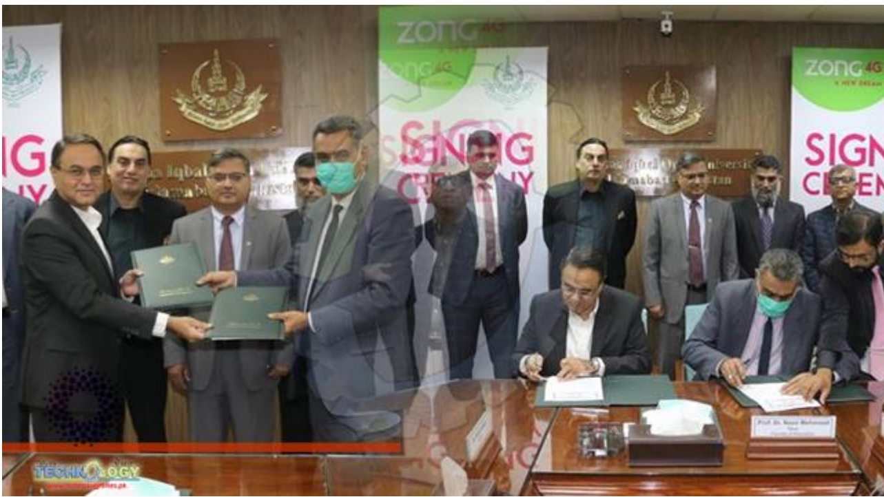
Free Health infrastructure facilities for students