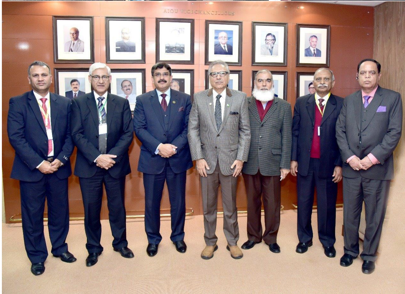
2- AIU's 1st International Conference on Climate Resilient Agriculture for Sustainable Development & Food Security (ICCRA-SD & FS-2022)