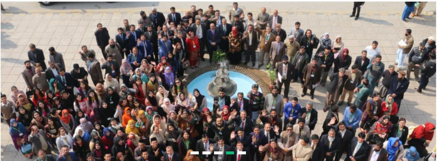
3- E-Commerce seminar