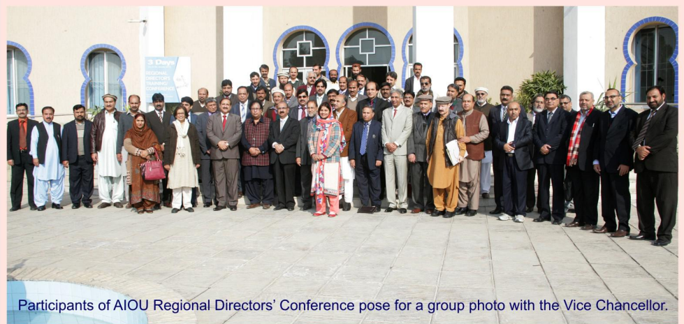
Participants of AIOU Regional Directors' Conference pose for a group photo with the Vice Chancellor.

During the conference, a training course on "Management, Accounts and Information Technology" was also conducted for the capacity-building of the participants.