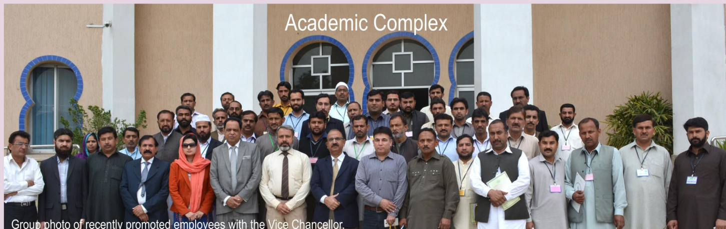
Group photo of recently promoted employees with the Vice Chancellor.